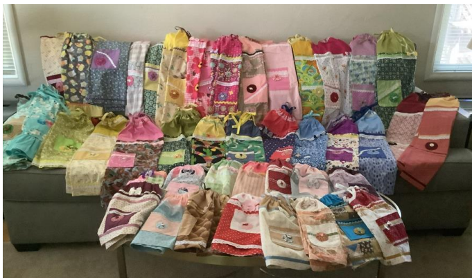
Figure 1- Dresses made by Wesley UWF